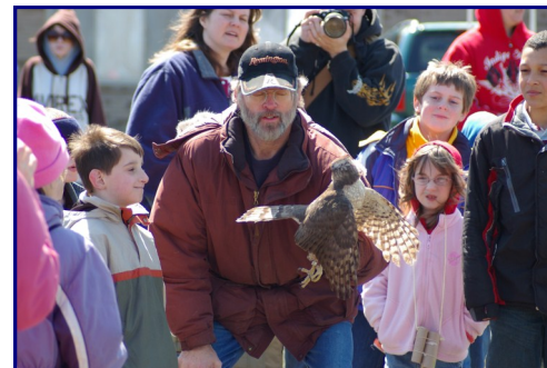
Visitors watch as a banded Cooper's Hawk is prepared for release.

Each spring BBRR offers field programs including Owl Prowls, Banding Station Tours and Hawkwatch Interpretation. Our biggest annual event, Bird of Prey Days , happens at the peak of migration towards the end of April. Various other public programs are offered throughout the year. Check our website for a current schedule. Group tours and programs are also offered to schools, scouts and any other organization wishing to learn about raptors and Braddock Bay. Contact us to find out more.