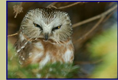
Northern Saw-whet Owls are a regular migrant visitor to Braddock Bay.

Braddock Bay Raptor Research (BBRR), an all volunteer organization, has been in existence since 1986 working towards preserving the area's natural resources by focusing research and education activities on the spectacular raptor migration. Research at Braddock Bay focuses on a range of topics important to conservation efforts, including the daily and seasonal distribution of raptors according to species, age and sex, and the behavior of raptors in migration. Educational programs are offered throughout the year and aim to expose people to the wonderful world of raptors through field experiences as well as off site visits.