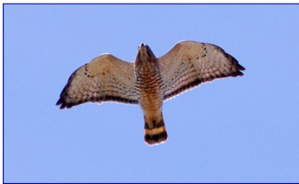
Broad-winged Hawks are our most common migrating hawk.

The hawk counts conducted at Braddock Bay number in the thousands with the highest recorded count of over 140,000 raptors in 1996.